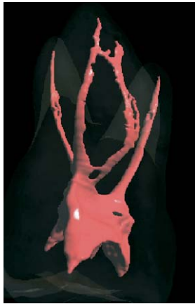
Figure 2. Mesio buccal view of root canal system of a maxillary first molar (MB root is centered). Reprinted with permission from Brown P, Herbranson E. Dental anatomy & 3D tooth atlas version 3.0. Illinois: Quintessence, 2005: Maxillary First Molars—3D Models 2. Bruce Fogel, UOP, Complex MB Root.)