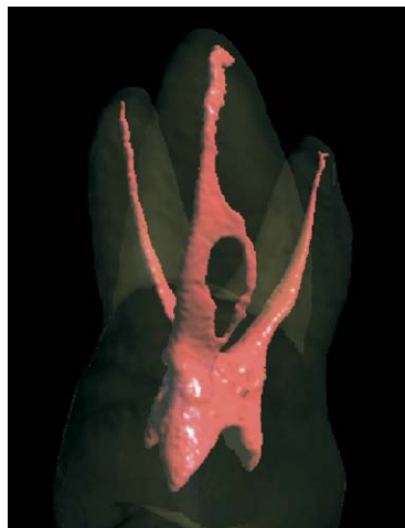
Figure 1. Mesiobuccal view of root canal system of a maxillary first molar (MB root is centered). (Reprinted with permission from Brown P, Herbranson E. Dental anatomy & 3D tooth atlas version 3.0. Illinois: Quintessence, 2005: Maxillary First Molars—3D Models 1. Unique Features.)